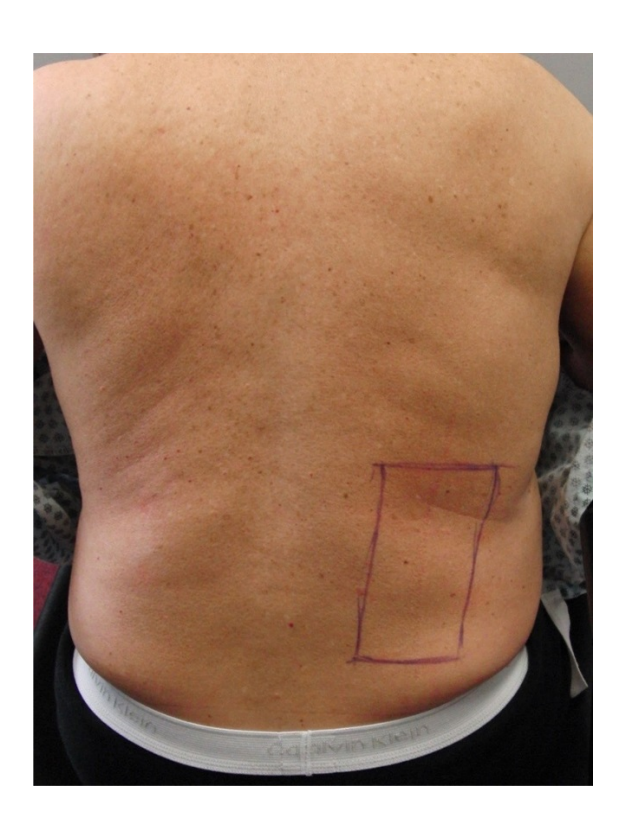
The high skin resistance pattern commonly associated with the Quadratus Lumborum Syndrome